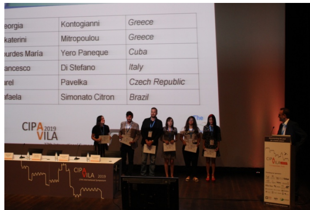
Awarding scholarships at the opening ceremony of the conference.

Thanks to this scholarship, I was able to attend this year's CIPA conference in Avila, Spain in September 2019. My paper was dealing with automated process to detect edges in unorganized point clouds.